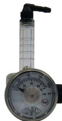
34,58,110 liter Part number: SFlow 2