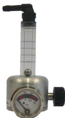
20 liter Part number: SFlow 1